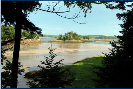
Low tide in Cobscook Bay.