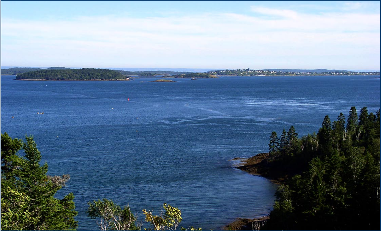
The Cobscook Bay Focus Area is renowned for its biodiversity and highly productive waters. The Nature Conservancy