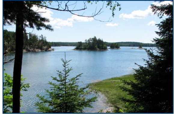
The same view at high tide. Ron Logan