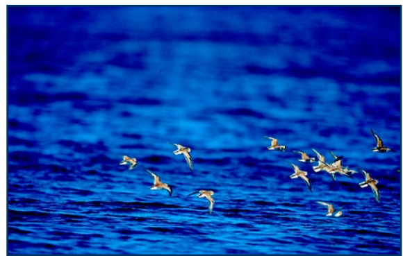
Cobscook Bay is an important stopover for migrating shorebirds. Bill Silliker