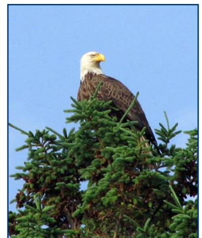
Bald eagle at Cobscook Bay. Ron Logan

Tidal Wading Bird and Waterfowl Habitat Inland Wading Bird and Waterfowl Habitat