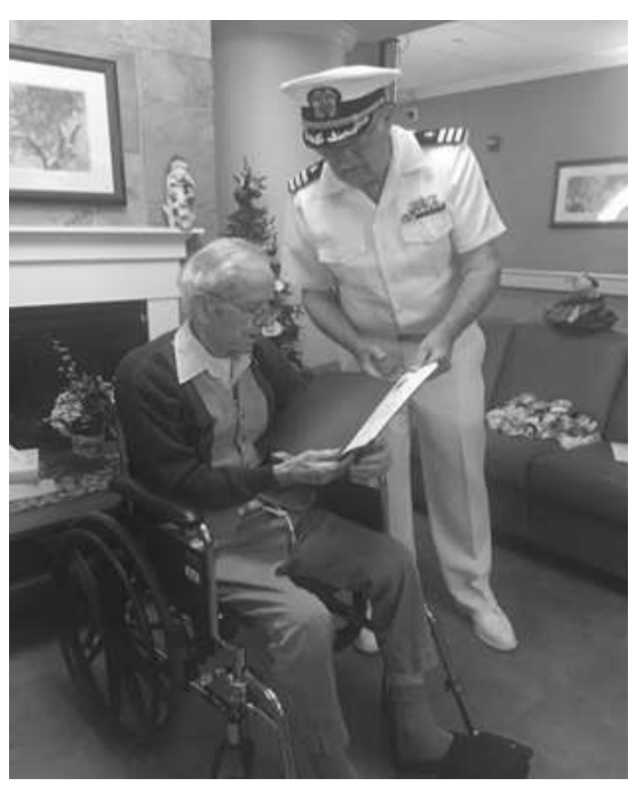
The USVA Togus hospital operates a 12 room hospice and palliative care center, opened in 2011. This end-of-life care wing provides first class care with the utmost respect and dignity for Maine veterans

Complete and file form VA 29-8636 (Application for Veterans' Mortgage Life Insurance).