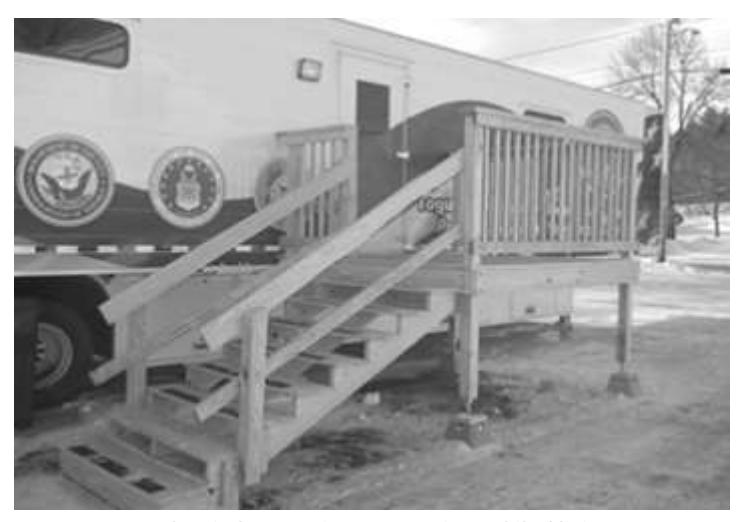
The Bingham, Maine Access Point Mobile Clinic

Checking Accounts ("Share Draft" accounts at credit unions) are transaction accounts —