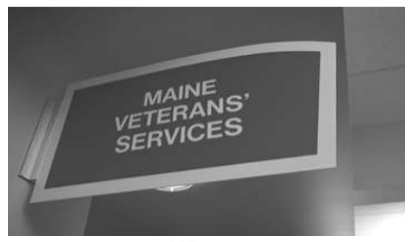
MBVS Office, Augusta, ME

Bureau of Rehabilitation Services Administrative Office 150 State House Station (45 Commerce Drive) Augusta, 04333-0150 (207) 623-6799 http://www.maine.gov/rehab/offices.shtml