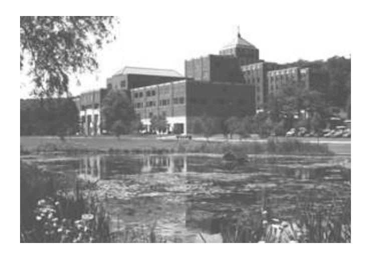
USVA Togus: The nation's first federally-chartered veterans' hospital

If you're a current or former member of the Reserves or National Guard, you must have been called to active duty by a federal order and completed the full period for which you were called or ordered to active duty. If you had or have active-duty status for training purposes only, you don't qualify for VA health care.