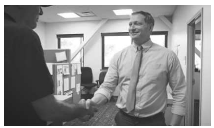
MBVS staff serving a Maine veteran.

"Other services may be provided to assist veterans in starting their own businesses, or independent living services for those who are severely disabled and unable to work in traditional employment."