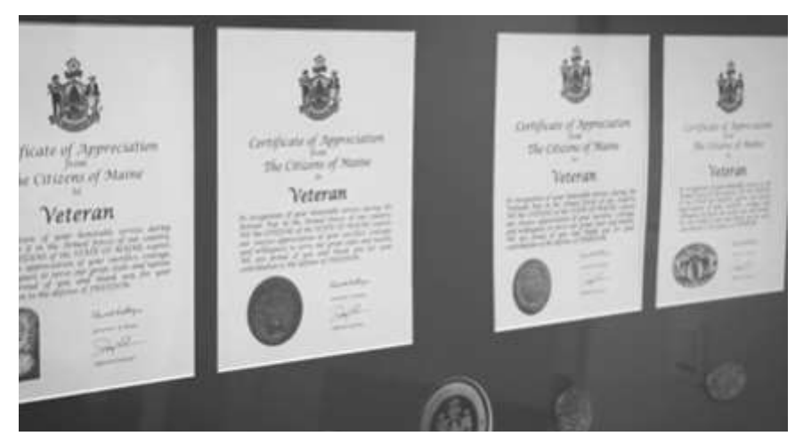
Honoring Maine Veterans

Military Order of the Purple Heart: <a href="https://www.purpleheart.org/">https://www.purpleheart.org/</a> Maine Bureau of Veterans Services: <a href="https://www.maine.gov/veterans">http://www.maine.gov/veterans</a>