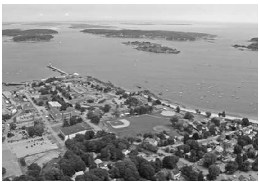
Southern Maine Community College Campus