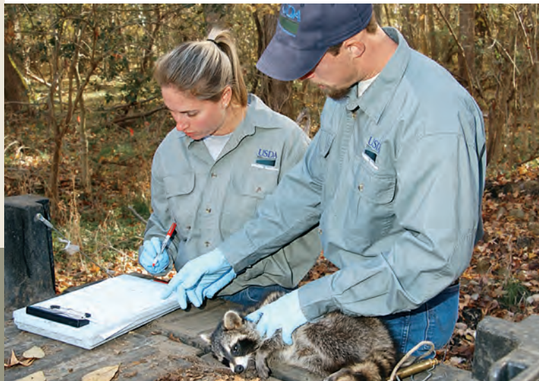
WS employees take samples from an anesthetized raccoon. Results of tests on the tissues will reveal whether or not this animal ingested enough rabies vaccine to be protected.

Next, WS sends all samples to cooperating Federal and State laboratories, where tests determine the rabies antibody level for each raccoon sample to see if the animal has had contact with the oral vaccine. In addition, WS submits all tooth samples to laboratories for sectioning to determine if they contain a tetracycline biomarker that indicates that the bait was ingested by the raccoon. When tetracycline is consumed, it stains teeth and bone.