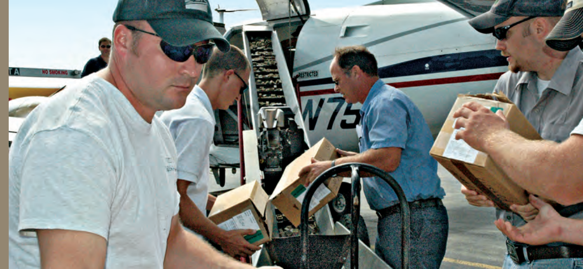
Aerial drops of ORV baits are the most cost-effective way to distribute vaccine in rural areas. Here, WS employees load baits onto a fixed-wing aircraft.