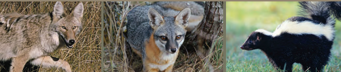
Pictured are some of the wildlife species that commonly spread rabies—coyote, fox, and skunk.

WS established its National Rabies Management Program in recognition of the changing scope of rabies. The program aims to prevent the further spread of rabies by containing the raccoon variant and, eventually, to eliminate terrestrial rabies in the United States through an integrated program involving the use of oral rabies vaccination (ORV) of wildlife.