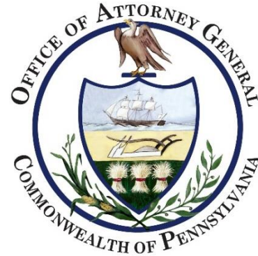
COMMONWEALTH OF PENNSYLVANIA JOSH SHAPIRO ATTORNEY GENERAL