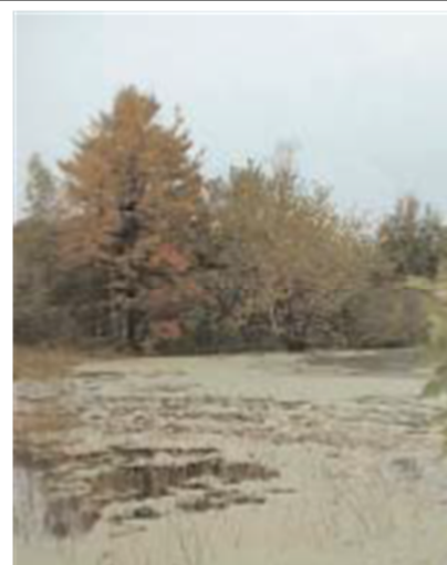
High phosphorus levels in lakes cause dense algae blooms, which can accumulate along the shoreline as shown above.