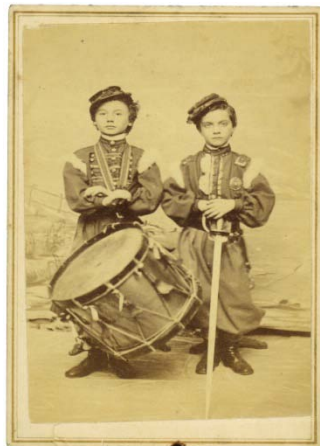
Figure 8-Unknown (Miscellaneous 6) drummer boys

Author Houston, Henry Clarence, 1847- Title The Thirty-second Maine regiment of infantry volunteers; an historical sketch / by Henry C. Houston . Publisher Portland, Press of Southworth Brothers, 1903 Call No. : 973.7441 I32h 1903