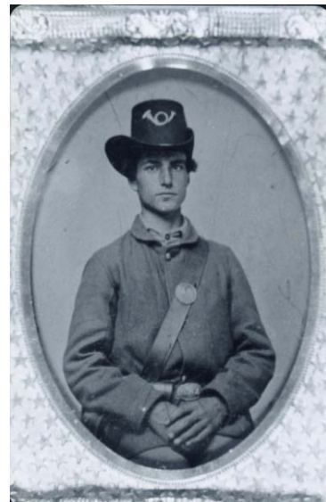
Figure 7-Unknown Enlisted Infantry (107)