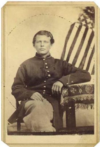
Figure 6-Unknown Enlisted Infantry (76)