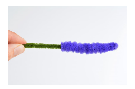
Instructions & photos from: https://onelittleproject.com/pipe-cleaner-