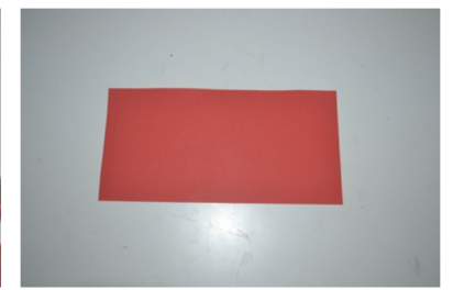
STEP 2: Fold your piece of paper in half. If your paper has white on one side, make sure the color side is facing out.