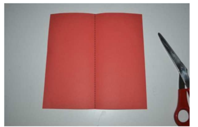
STEP 1: Fold your piece of paper in half. Cut along the crease.

You can <u>make two hearts</u> with one piece of paper.