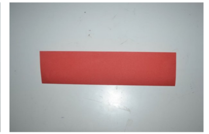
STEP 3: Fold your page in half again, but in the other direction. Then unfold it.