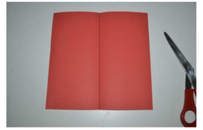
STEP 1: Fold your piece of paper in half. Cut along the crease.

You can <u>make two hearts</u> with one piece of paper.