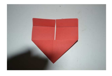
STEP 6: Fold down the corners and indicated to form the heart shape. Turn over and you're done!