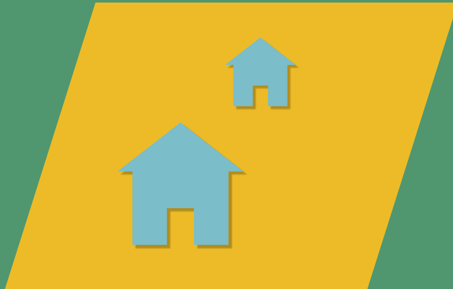
One Unit + One ADU (attached or detached)

ADU: At least one ADU (attached or detached) is permitted on lot (up to 3 units total).