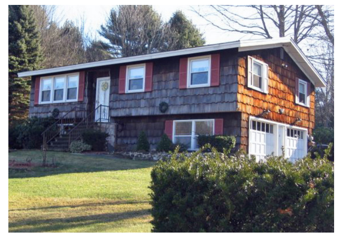
South Portland, 1973