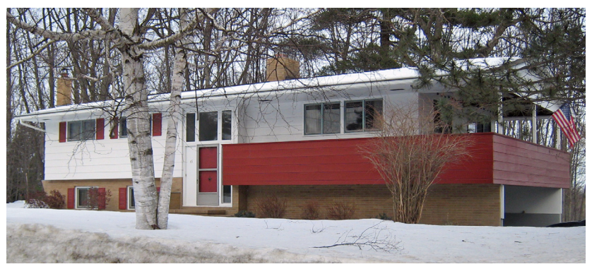
1964, Old Town

By the late 1960s, the Maine-built Raised Ranch is very consistent. The second floor overhangs the first. The entry is in the front facde, slightly off center, and often recessed into the facade. The wider side has two bays, and contains sleeping and private spaces, identifiable by the smaller, higher set window openings. The narrower side contains the living space, which inevitably has a single, large window opening ("picture window"). The garage is integrated in the lower level of the wider side.