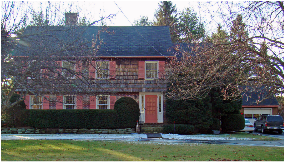
This page: three Garrison examples. Note second story overhang and use of contrasting siding materials. Three bay examples were most common (see both houses, above); two or four bay examples (such as that at the left) were less common. The one-car garage is small and recessed or turned to minimize its visual impact.