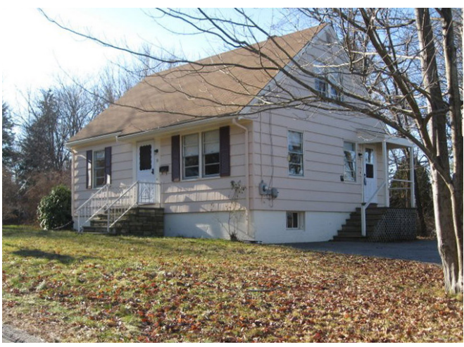
1954, South Portland. W.O. Armitage, Architect

Window openings are irregularly placed - note different sill heights