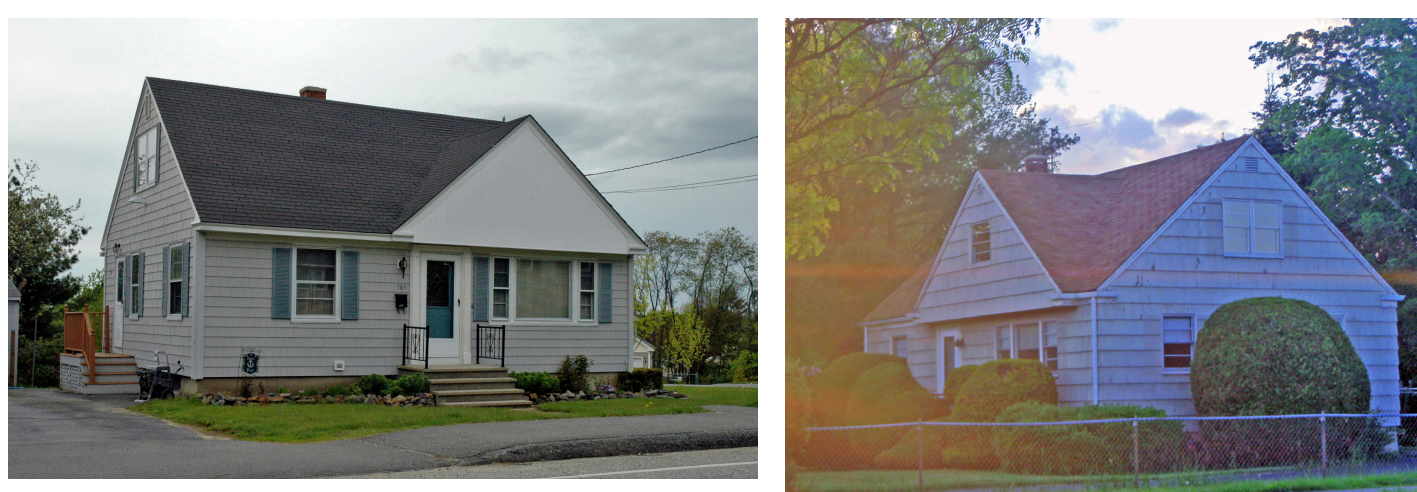
1955, South Portland