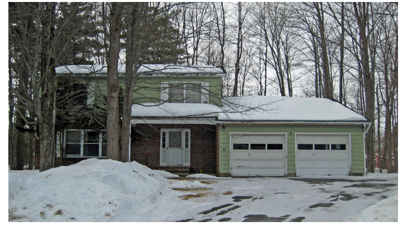
1973, Old Town

On this page, the lower two images show how the garage roof extends to form an entrance porch across the main volume of the two-story house. The two car garage is a prominent feature of the facade.