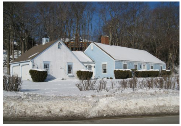
1972, Cape Elizabeth