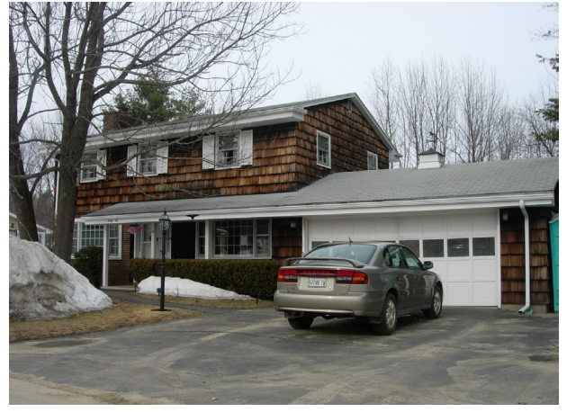
ca. 1967, Lewiston