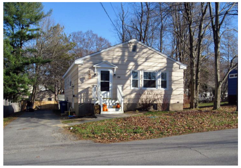
The house at right was built in 1967. The same developer built an identical one nearby in 1956.