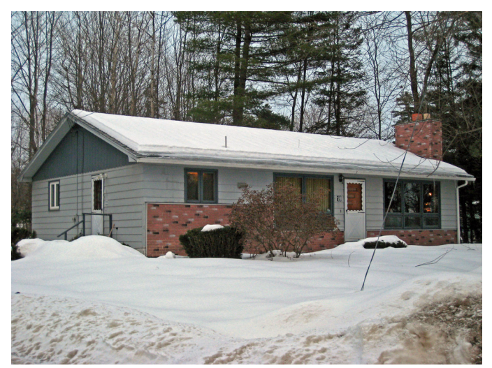
1971, Old Town