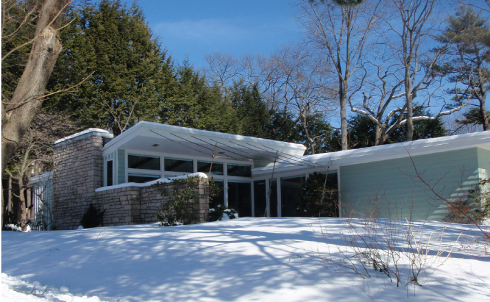
1951, Portland. Wadsworth, Boston, et. al., architects

Roofs are flat, or gable with a very low pitch. Flat roofs likely built-up and low pitched roofs have asphalt shingles. Gable roofs typically have deeply overhanging eaves and may have exposed framing/rafter ends.