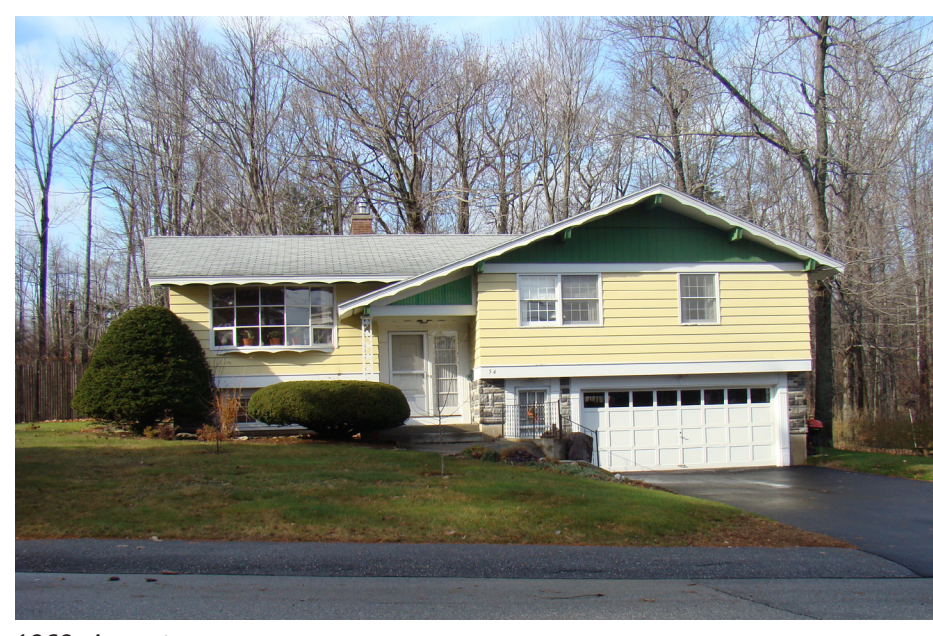
Left and below: Yes, its a Raised Ranch. Note the roof height is continuous and the primary living space is on a single level.