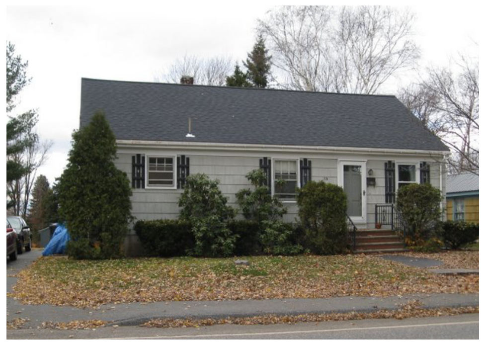
1957, South Portland

Vernacular houses are those that are either so simple they lack enough detail to fit an architectural style, or that combine elements from so many styles the resulting house can't be categorized.