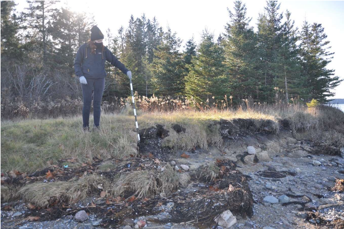
Documenting Midden Erosion, 2020.