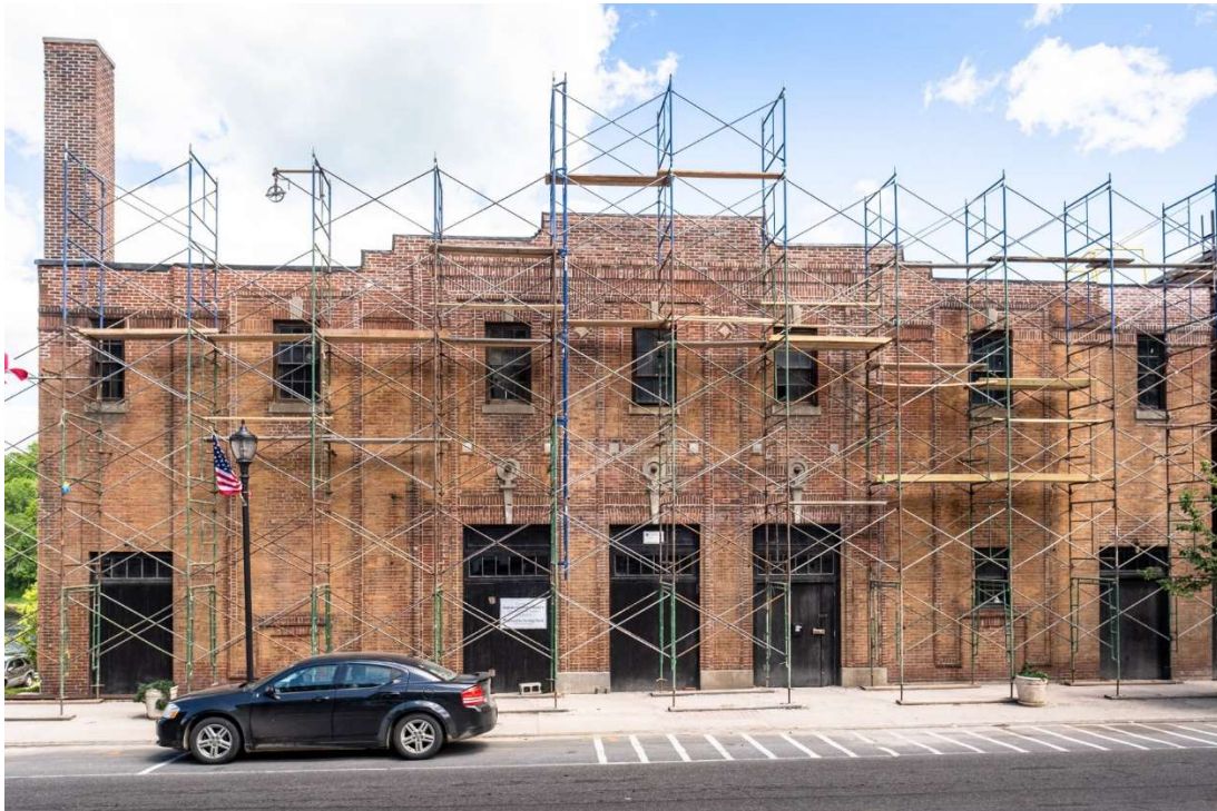
Colonial Theater, Augusta, June 2020.

All applications to be submitted via email.