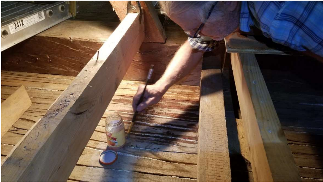
Trompe l'oeil ceiling repair, Union Meeting House, Readfield, 2020