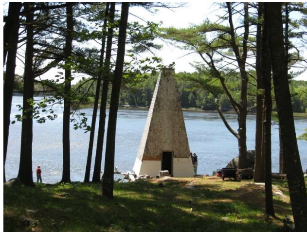
Fiddler's Reach Fog Bell Tower, Arrowsic, 2009

The final selections of grant awards are reviewed by the entire Commission at a quarterly Review Board Meeting and they then vote whether or not to accept the recommendations and award the grant.