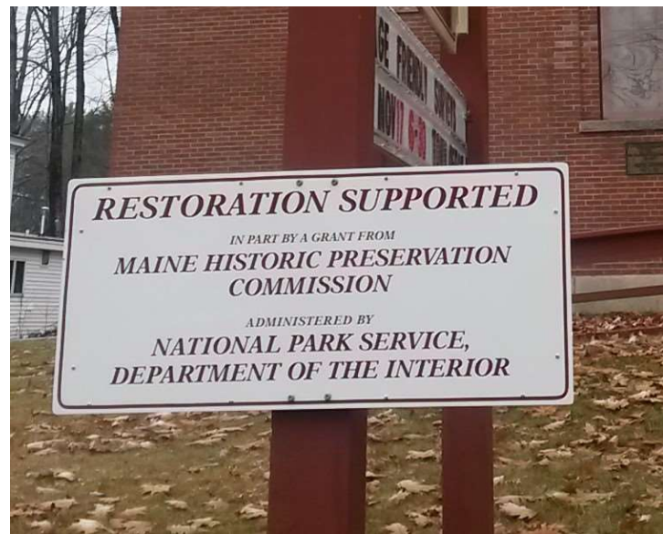
Readfield Union Meeting House Project Sign, 2016.