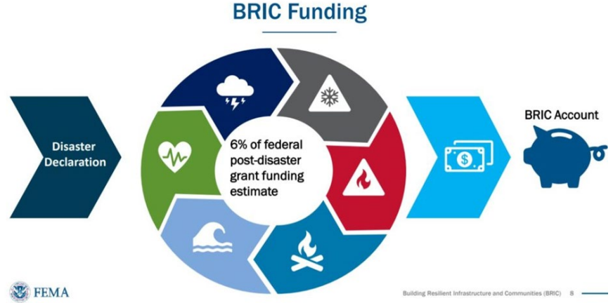
Figure 3.1: BRIC Funding is based on estimates of multi-hazard post-disaster funding.

The BRIC program makes Federal funding allocations available annually for State and National Competition, and Tribal set aside. The BRIC program seeks to fund effective and innovative activities that address future risks to natural disasters, including ones involving wildfires, drought, hurricanes, earthquakes, extreme heat, and flooding (Figure 3.1). Addressing these risks helps communities become more resilient. Funding can be used for 1) Capacity-and Capacity-Building (C&CB) activities including hazard mitigation planning; building code adoption & enforcement activities; project scoping to identify mitigation action; and 2) Mitigation Projects including culvert upsizing/drainage improvements, acquisition/demolition, critical infrastructure retrofits/upgrades, and road/bank stabilization. Maine state agencies, local governments, and municipalities have applied for BRIC grants to assist with updating local hazard mitigation plans, project scoping, building code training, and management costs. Funding is only available to those with current FEMA-approved LHMPs.