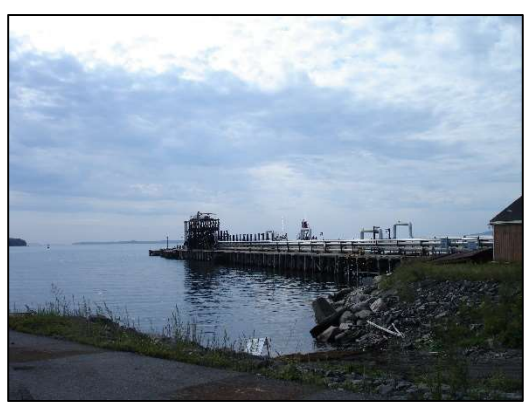
Figure 6: Liquid Bulk Pier8

face. The pier is equipped with petroleum manifolds for handling liquid bulk cargoes intended for Irving Oil, which leases property from the Maine Port Authority located adjacent to the Port.