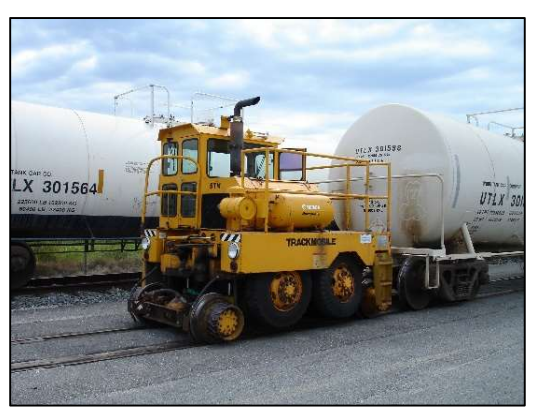
Figure 9: Trackmobile and Rail Car Transfer Facility<sup>67</sup>

industry over the past several years, however has also reduced the demand for kaolin. To preserve this business, alternative uses for the kaolin as well as alternative uses for the kaolin transloading facilities, which are in excellent condition, could be considered.