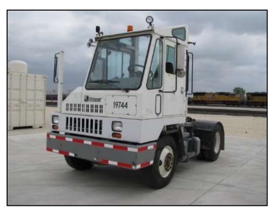
Figure 12: Typical Yard Hostler for Cargo Handling<sup>73</sup>

dry cargo pier. In order to better handle containerized cargo, the Port would also need to develop a chassis pool for handling standard intermodal ocean containers.