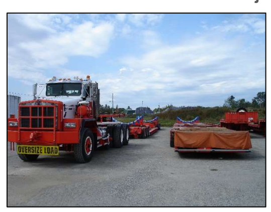
Figure 11: Typical Oversized Vehicle Movers for Project Cargoes<sup>72</sup>

One major constraint at the dry cargo pier is constricted traffic flow due to the limited apron width on the pier. The addition of yard hostlers, which have a much shorter turning radius than standard semi-trucks, to the Terminal's fleet of cargo handling equipment would increase efficiency by enabling smoother flows of cargo on and off the