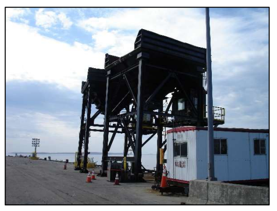
Figure 10: Dock Bulk Loader and Telestacker<sup>71</sup>

The Port has identified a number of items that would improve the facility's cargo-handling capabilities, which should be implemented over the next several years to help enable future business growth at the terminal<sup>70</sup>. To facilitate efficient biomass and other bulk loading operations, a new dock stand is required that can accommodate the Terminal's existing telestacker conveyor system for ship loading. Expansion of the fixed electrical cabling for this cargo handling equipment will also be needed.