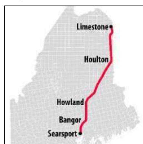
Figure 7: Bangor Gas Pipeline Corridor9

An existing fuel oil pipeline runs from the Searsport terminal, through Bangor, to the Loring Commerce Centre (former Loring Air Force Base) in Limestone, Maine as shown in Figure 7. The 200-mile long pipeline was decommissioned in 1994. A portion of the corridor is now used for natural gas transmission by Bangor Natural Gas, which purchased the rights to the pipeline in 2012. Proposed uses for the pipeline corridor have included a possible refinery at Loring, a fiber optic cable right-of-way and a gas pipeline connector.