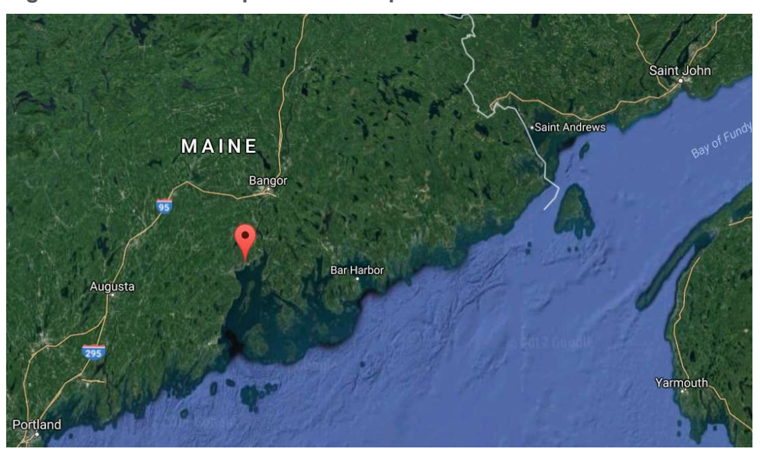
Figure 1: Port of Searsport Aerial Map<sup>1</sup>

The Port of Searsport, located on the Penobscot Bay near the entrance of the Penobscot River, serves as a distribution Port for the coastal area and inland areas between Bangor and Augusta. Additionally, inland areas extending up through the Province of Quebec into Canada rely on the Port. The Port is well suited to handle a multitude of cargoes including bulk, neo-bulk, break bulk, project and containerized cargo. Though some improvements are needed to bring the infrastructure at the Port up to current operating standards, the elements that make the Port advantageous to existing and potential businesses include available property area for expansion and direct access to rail, road and pipeline.