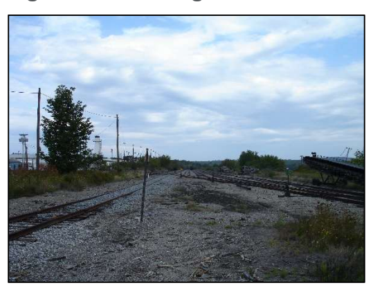
Figure 13: Existing Main Rail Yard and Heavy Weight Pad Area<sup>75</sup>