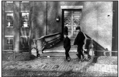
Three boys entering mill to go to work at 5:30 a.m. Lewiston, Maine.

Each employer must display a poster that summarizes youth employment laws. The poster is available free from the Maine Department of Labor at: www.maine.gov/labor/posters/index.html .