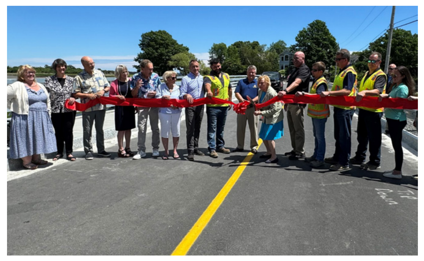
Governor Mills cuts a ribbon re-opening the Pier Road Causeway in Kennebunkport on July 1, 2024, after it was raised 4 feet higher to protect access and infrastructure. The project was made possible with funds from the Maine Infrastructure Adaptation Fund.

PowerWise Systems based in Bucksport received $19,000 from the Jobs Plan to help tell the story of its work to