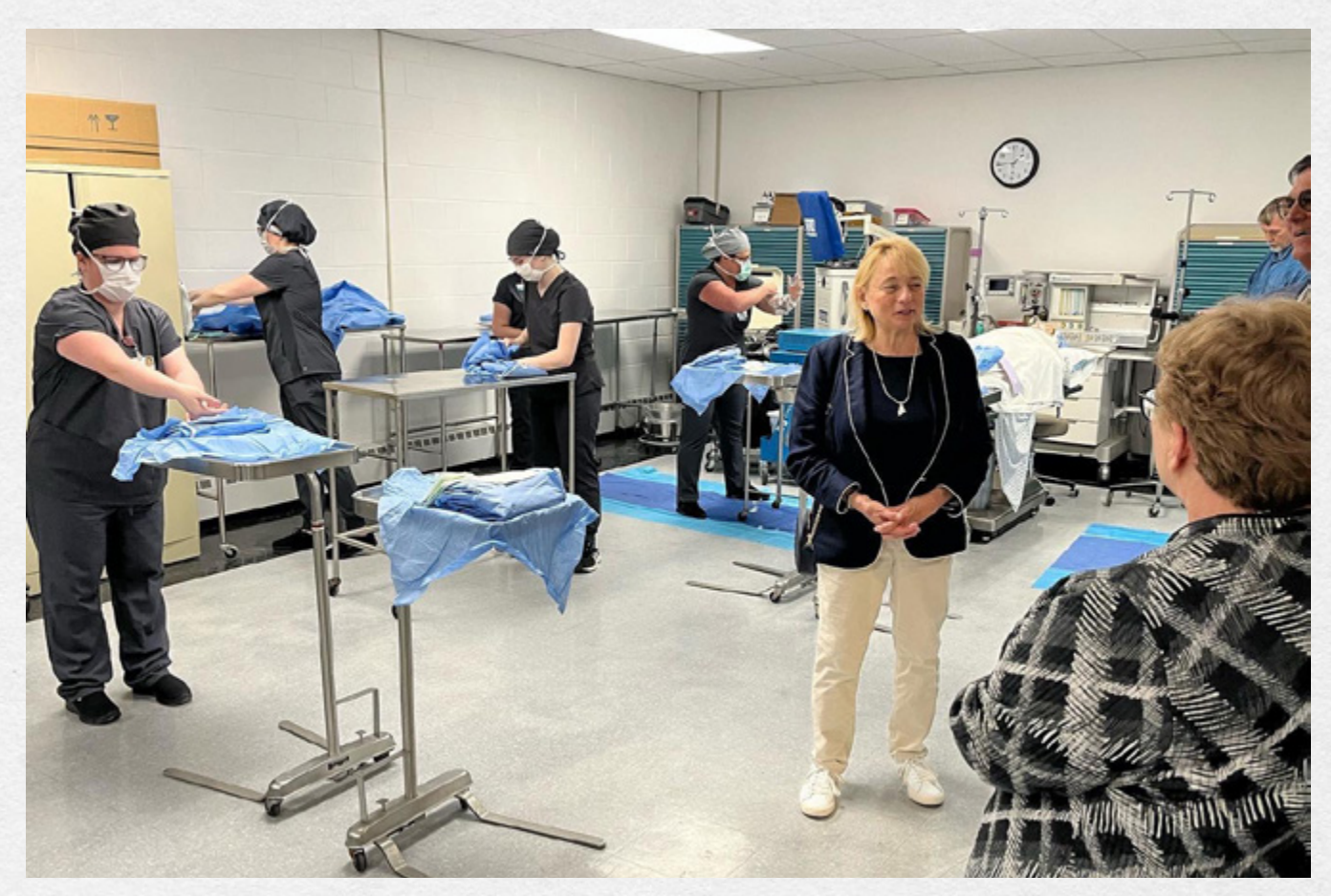
Governor Mills tours a surgical tech class at Eastern Maine Community College in Bangor.