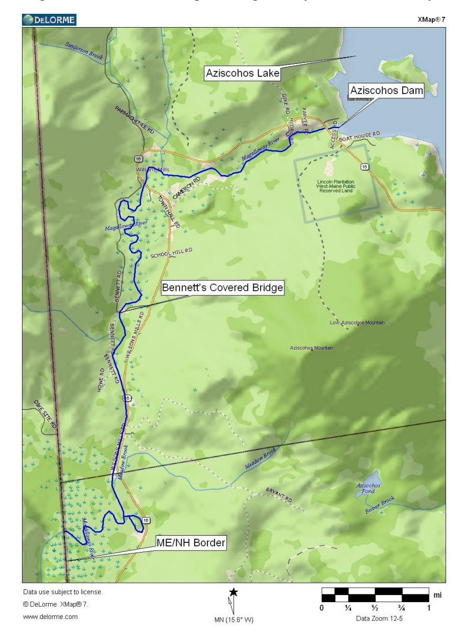
Figure 1. Site location map for Magalloway River creel surveys.