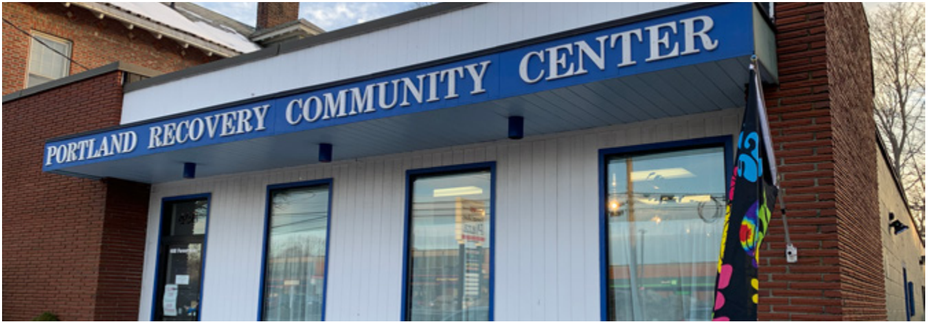
Original site of Portland Recovery Community Center