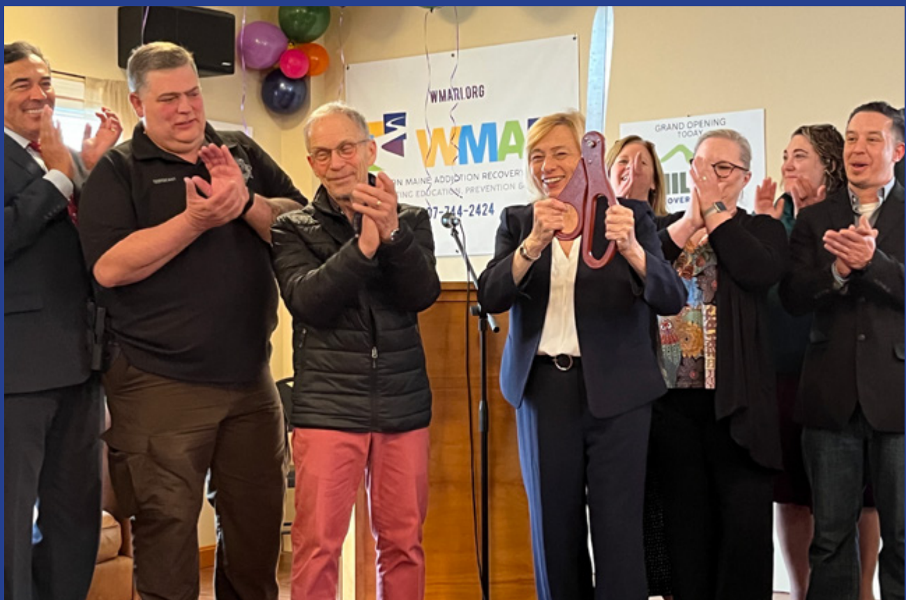
Gov Mills at opening of Hills Recovery Center in Norway 2023