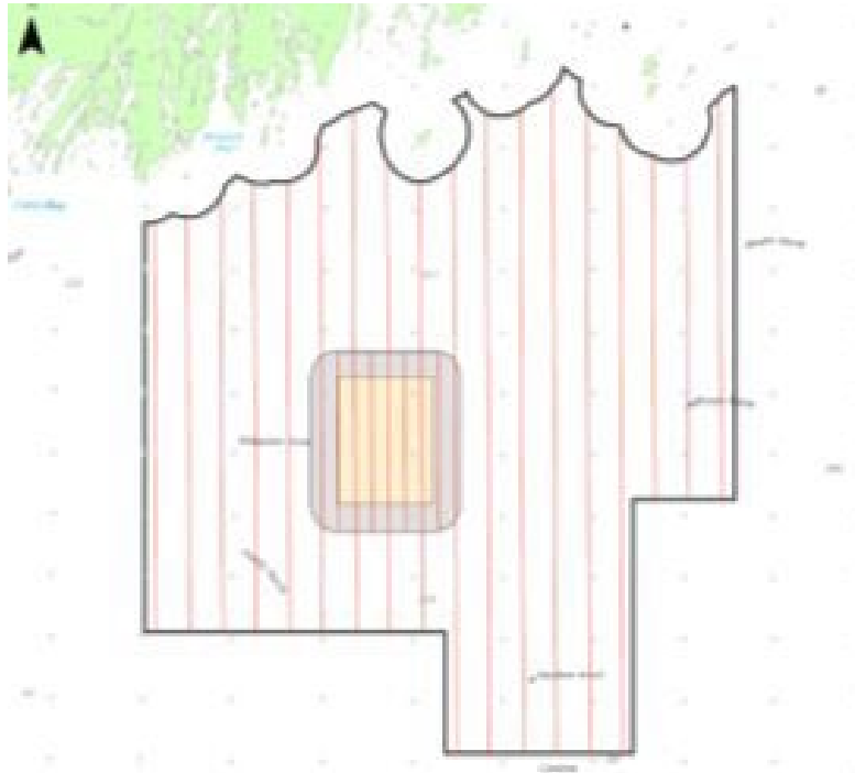
Figure 3: Aerial digital survey transects in the Gulf of Maine and RFCI

From May 2023 through February 2024 PTOW sponsored four quarterly digital aerial wildlife surveys of the Request for Competitive Interest (RFCI) area, plus a buffer (Figure 3).