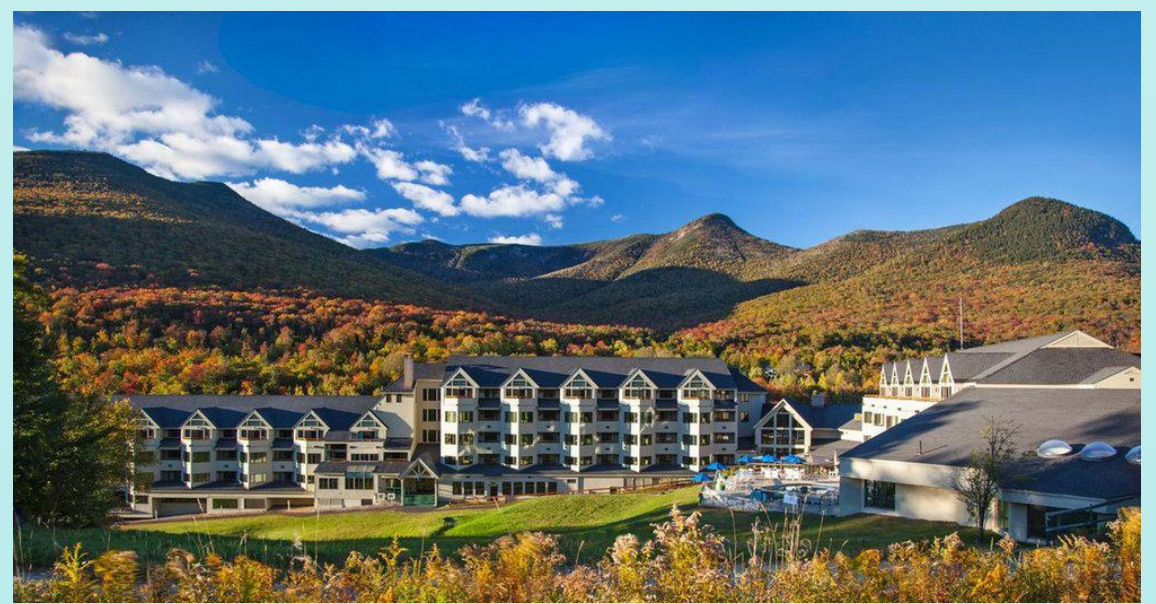
Loon Resort & Spa - Lincoln, NH MAY 28 & 29, 2020