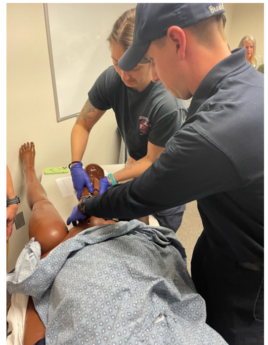
Participants practice skills in Basic Life Support in Obstetrics (BLSO) training.