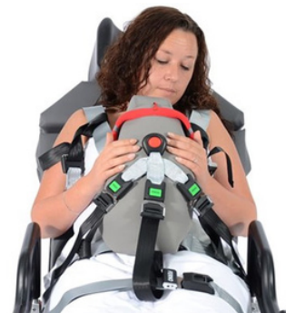
KangooFix Neonatal Transport Device