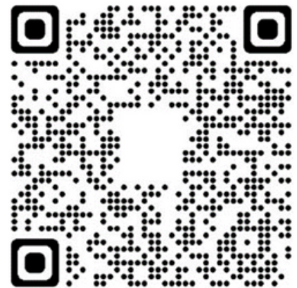
Pen Bay Pilot QR Code

Van Buren Ambulance is no longer an Explorer Program pilot site. The Explorer Team is looking to establish another pilot site in Aroostook County.