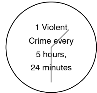
Number of Offenses — Comparative Data 2014–2015