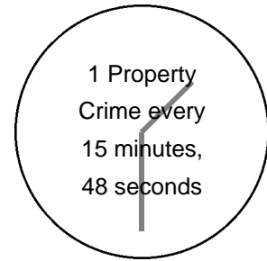
Number of Offenses — Comparative Data 2000–2001