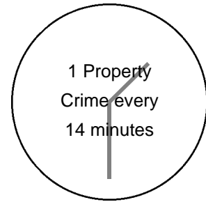
Number of Offenses — Comparative Data 1996–1997