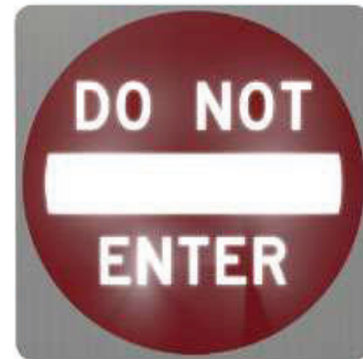
Do Not Enter Sign (R5-1) (48" x 48")