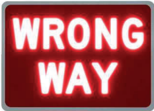
Wrong-Way Sign (R5-1a) (42" x 30")

The Flashing LED Signs shall meet the specifications.