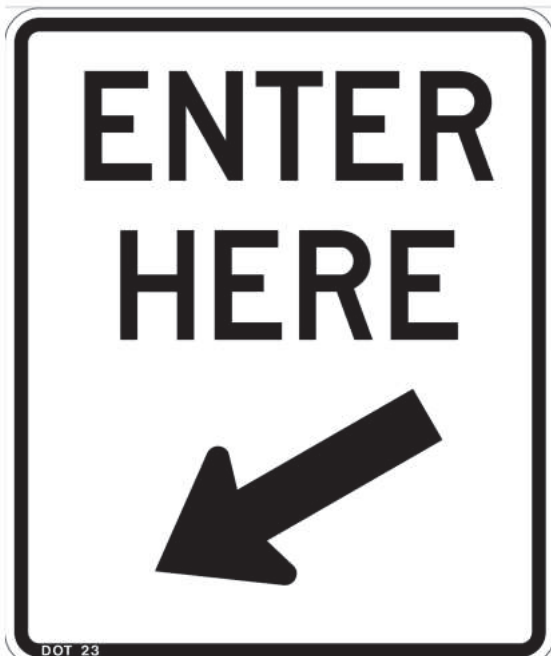
Enter Here Sign (36" x 48")