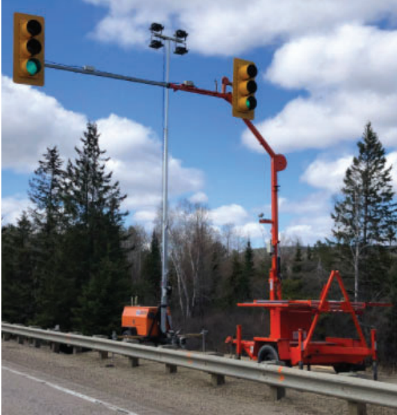
Example of Trailer Mounted type or SQ3