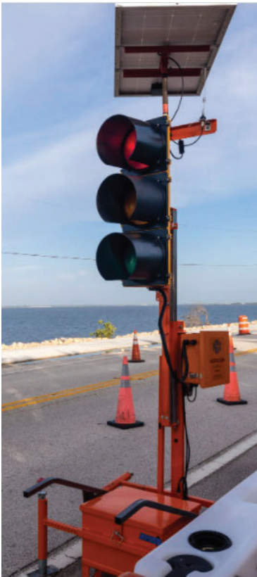
Example of Dolly type or SQ2