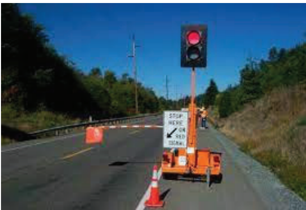
Example of an AFAD