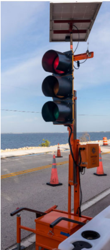
Example of Dolly type or SQ2