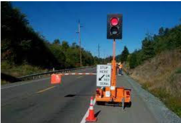
Example of an AFAD