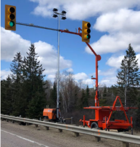
Example of Trailer Mounted type or SQ3