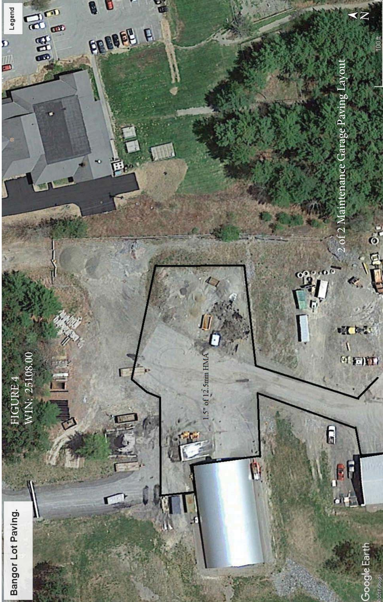
FIGURE 4 WIN: 25108.00