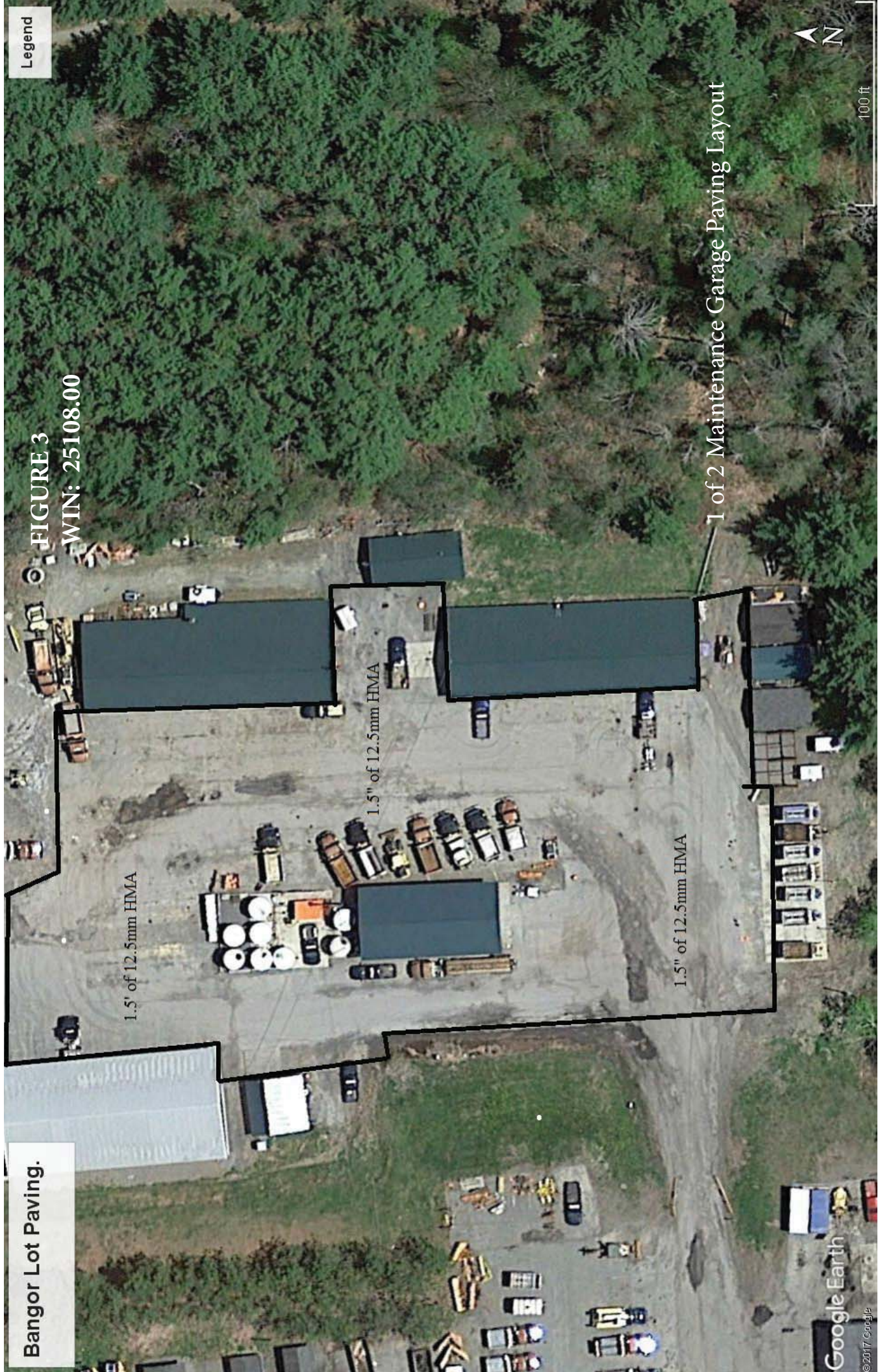
FIGURE 3 WIN: 25108.00