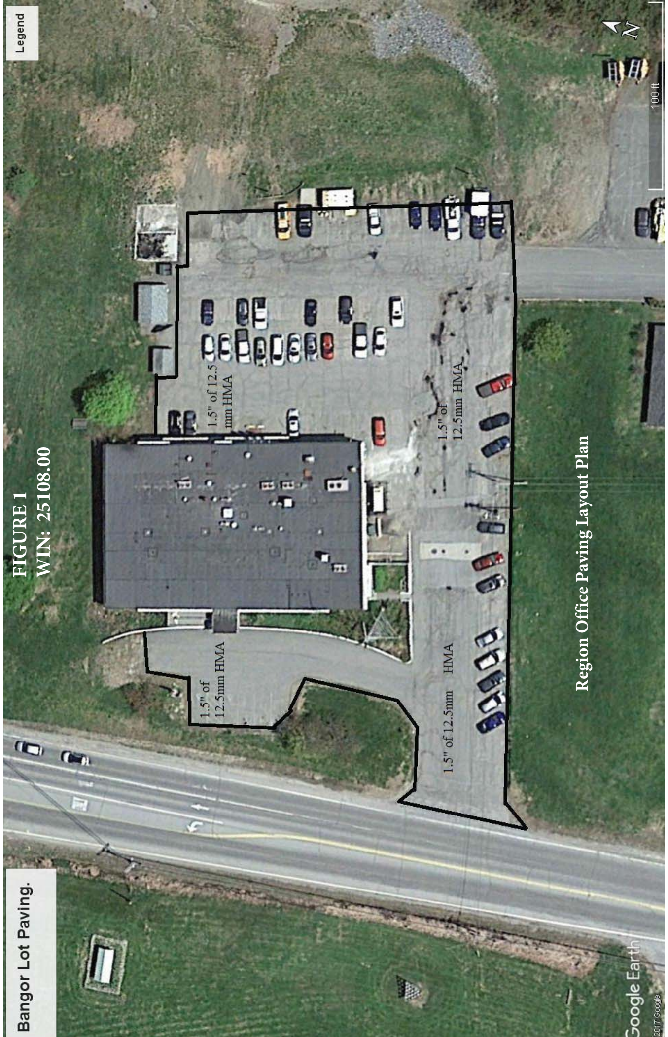
FIGURE 1 WIN: 25108.00