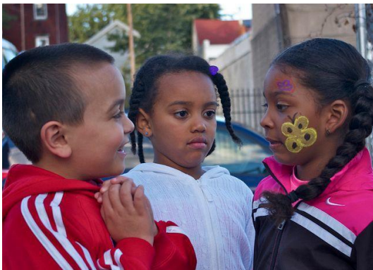
Listening & Speaking