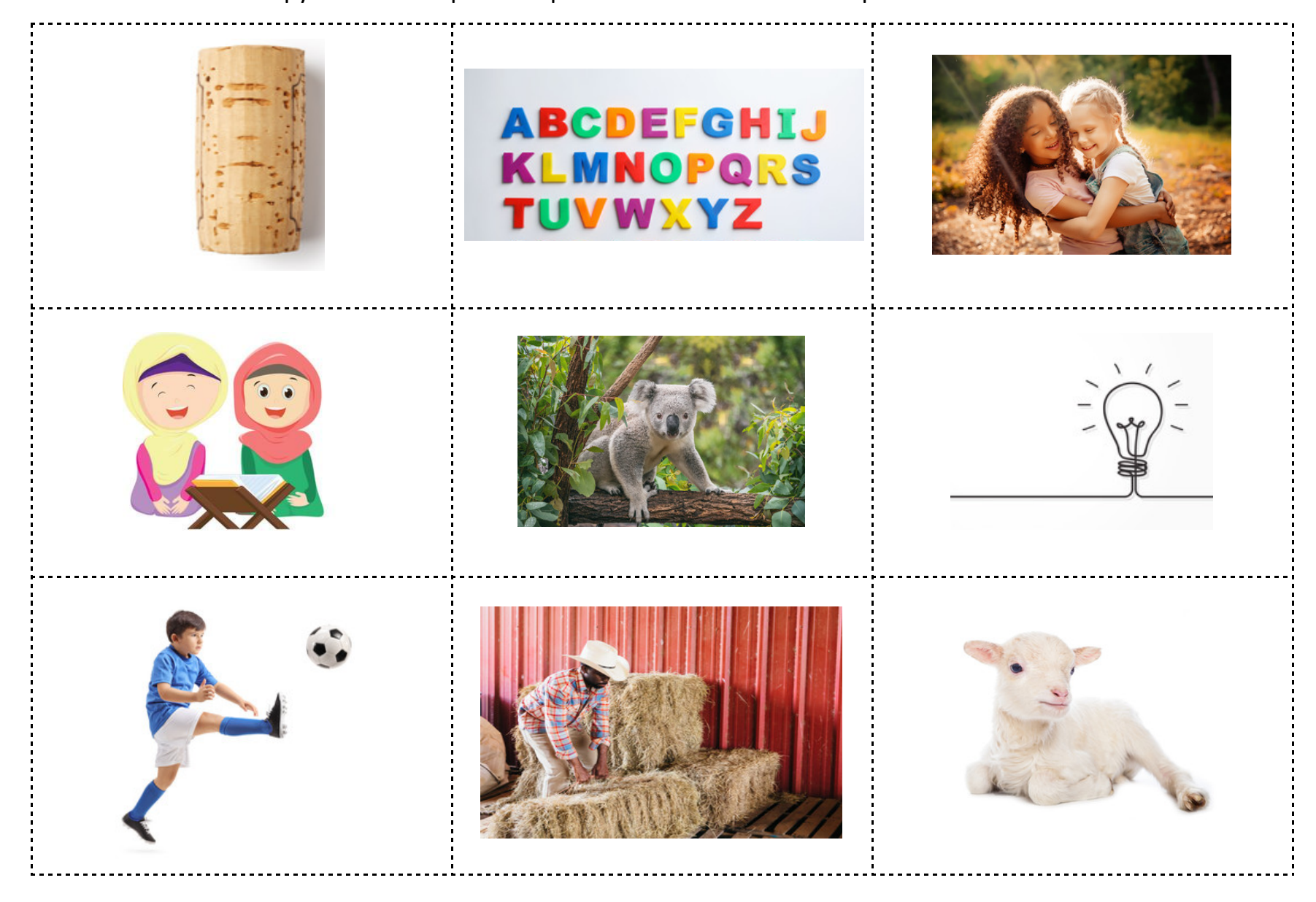
Word Work Station U2 W4