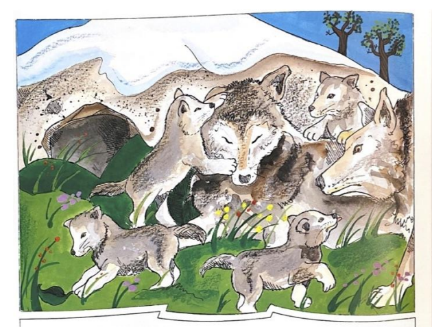
When the pups are about three weeks old, they are allowed out of their den to romp and play. The mother and some of the other wolves take turns babysitting while the rest of the pack is hunting. When the hunters return, the pups greet them. When they lick the wolves jaws, the wolves bring up some of the food they have eaten and feed it to the pups. The pups are now old enough to eat meat.