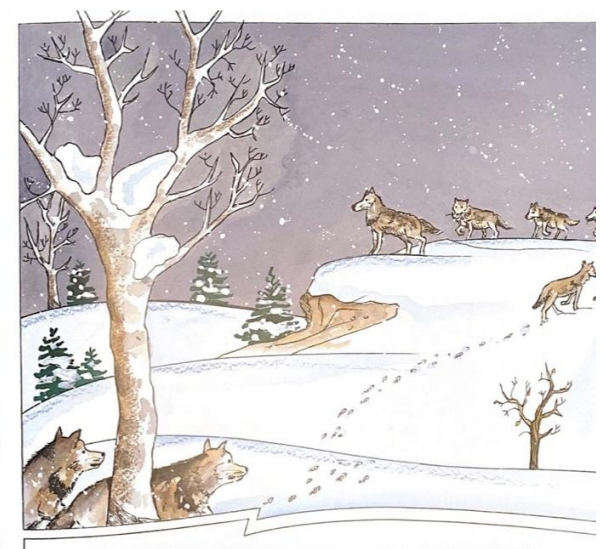
At six months old the pups are almost as big as the adult wolves. They are strong enough and old enough to begin learning how to hunt. They join the pack as it roams in search of food.