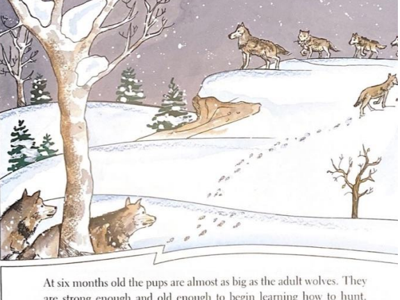
At six months old the pups are almost as big as the adult wolves. They are strong enough and old enough to begin learning how to hunt. They join the pack as it roams in search of food.