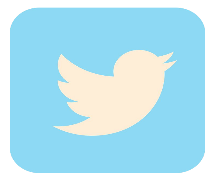
How and Why I Became a Teacher Twitter Convert