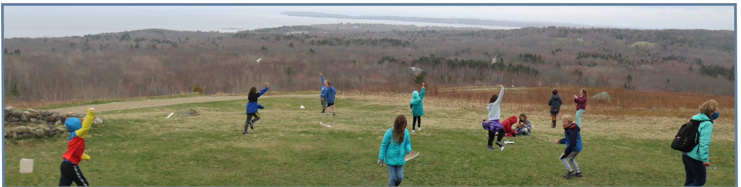
Image: Third-graders learn about forces and motions while flying kites at Tanglewood.