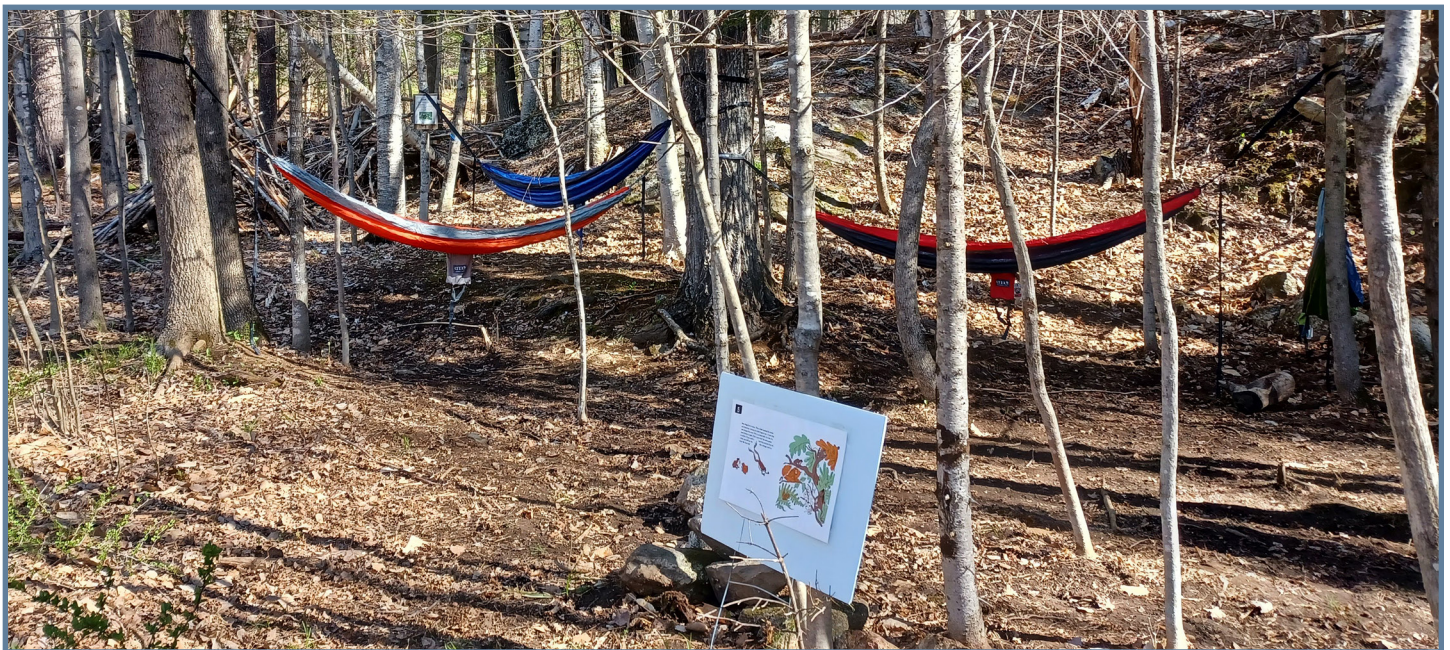
Image: Agnes Gray's "hammock grove," where students practice reading