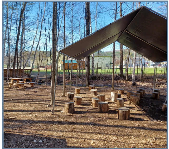
Image: An outdoor learning space at Agnes Gray

In June 2020, the Maine Department of Education (MDOE) was awarded a $16.9 million grant from the U.S. Department of Education's Rethink K-12 Education Models program to implement the Rethinking Responsive Education Ventures (RREV) program. The overarching purpose of RREV is to promote innovation in Maine schools so that all students across the state have access to high-quality and responsive learning opportunities. In August 2021, Agnes Gray Elementary School received a RREV award to develop and implement Teaching Outside: The Box , which began in the 2021-22 school year. MDOE engaged an outside research firm, ICF, to conduct an evaluation of the RREV program, including implementation of this learning model at Agnes Gray.