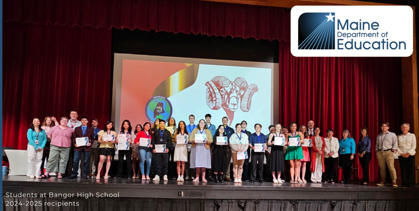
Students at Bangor High School 2024-2025 recipients