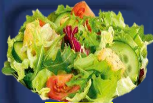
1 cup Veg.