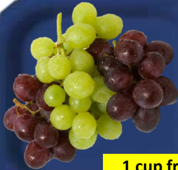
1 cup fruit