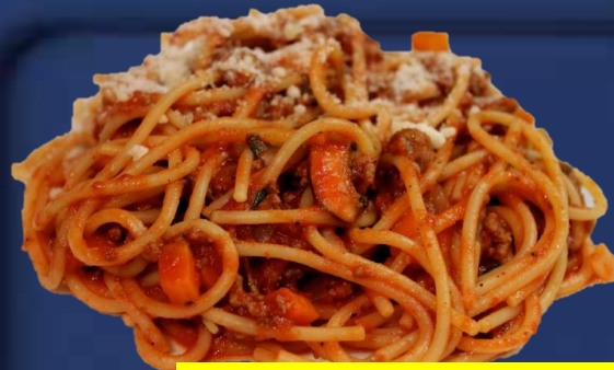
2 M/MA + 2 Grain