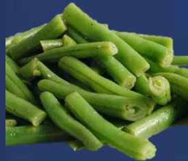
1/2 cup Veg.