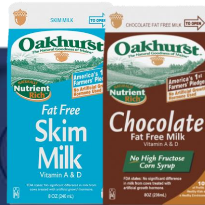
1 cup milk