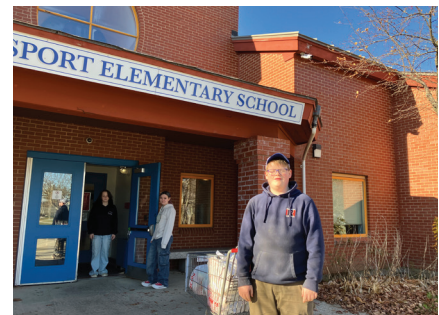
RSU 20 serves 400 students Pre-K through grade 12 in Searsport and Stockton Springs.

She also works closely with teachers and administrators. "It's so important that teachers know what McKinney-Vento does. That way they can refer students and families, and we can reach out and offer support early."