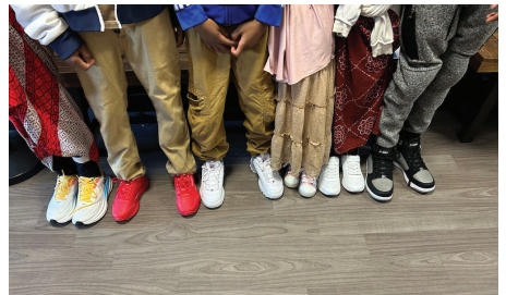
Lewiston students are pictured wearing new shoes from the Student Resource Center.