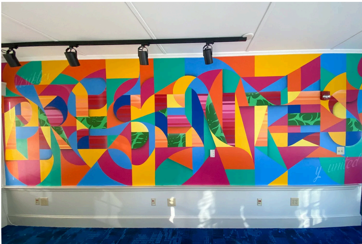
'Visibles, Presentes y Unidos', Bowdoin College, Brunswick, ME, 2022