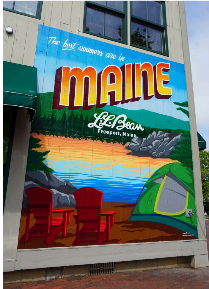
L.L.Bean Maine Summer, Freeport, ME, 2023