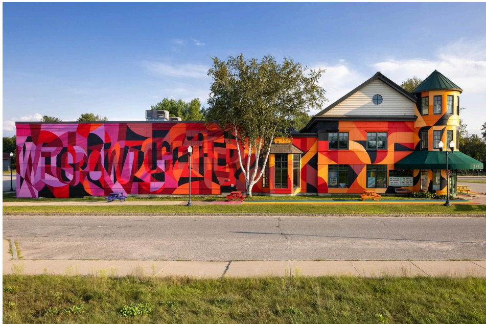
'Gem Theater Mural', Gem Theater, Bethel, ME, 2021

nature, feelings, and big ideas. His art isn't just in Maine; you can find his work in many cities all around the world!