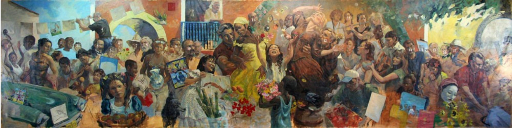
Dance of Two Cultures Brunswick Christopher Cart, 2008