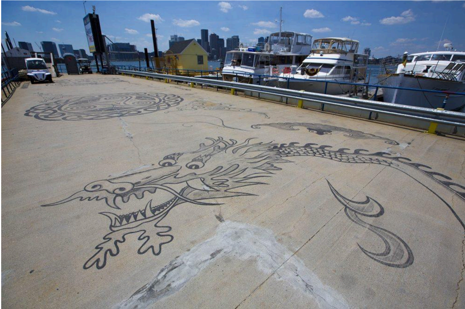
Connected by Sea Liz LaManche, 2014