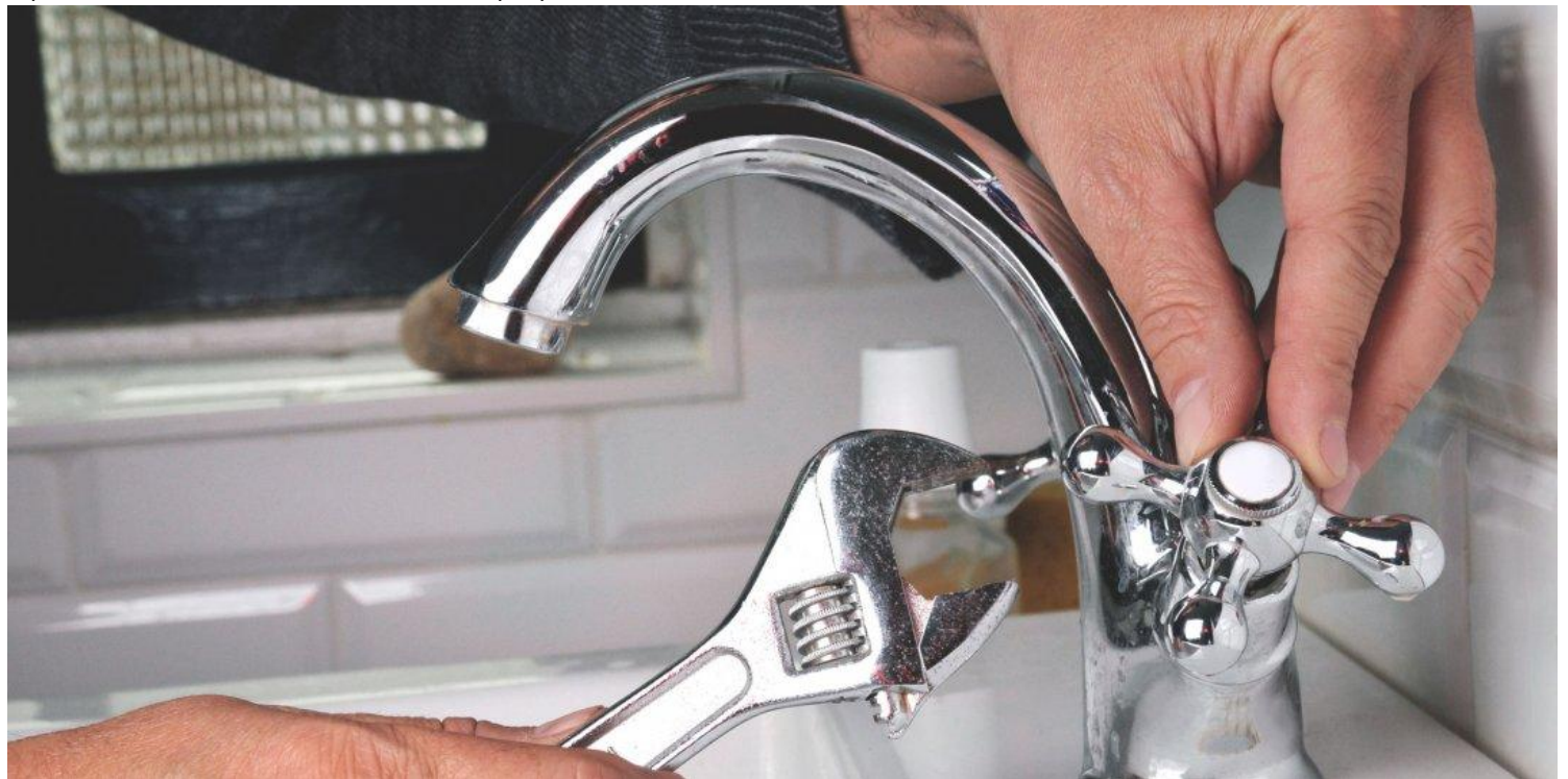
If the faucet leaks, fix it!

https://www.askmen.com/man_skills/home/how-to-fix-a-leaky-faucet.html