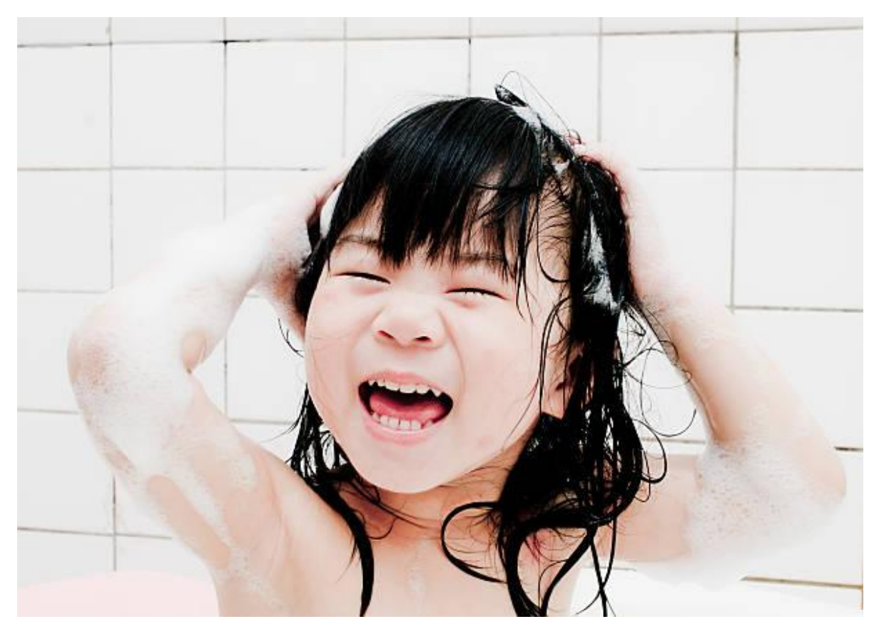
Take short showers. Turn the water off when you are washing