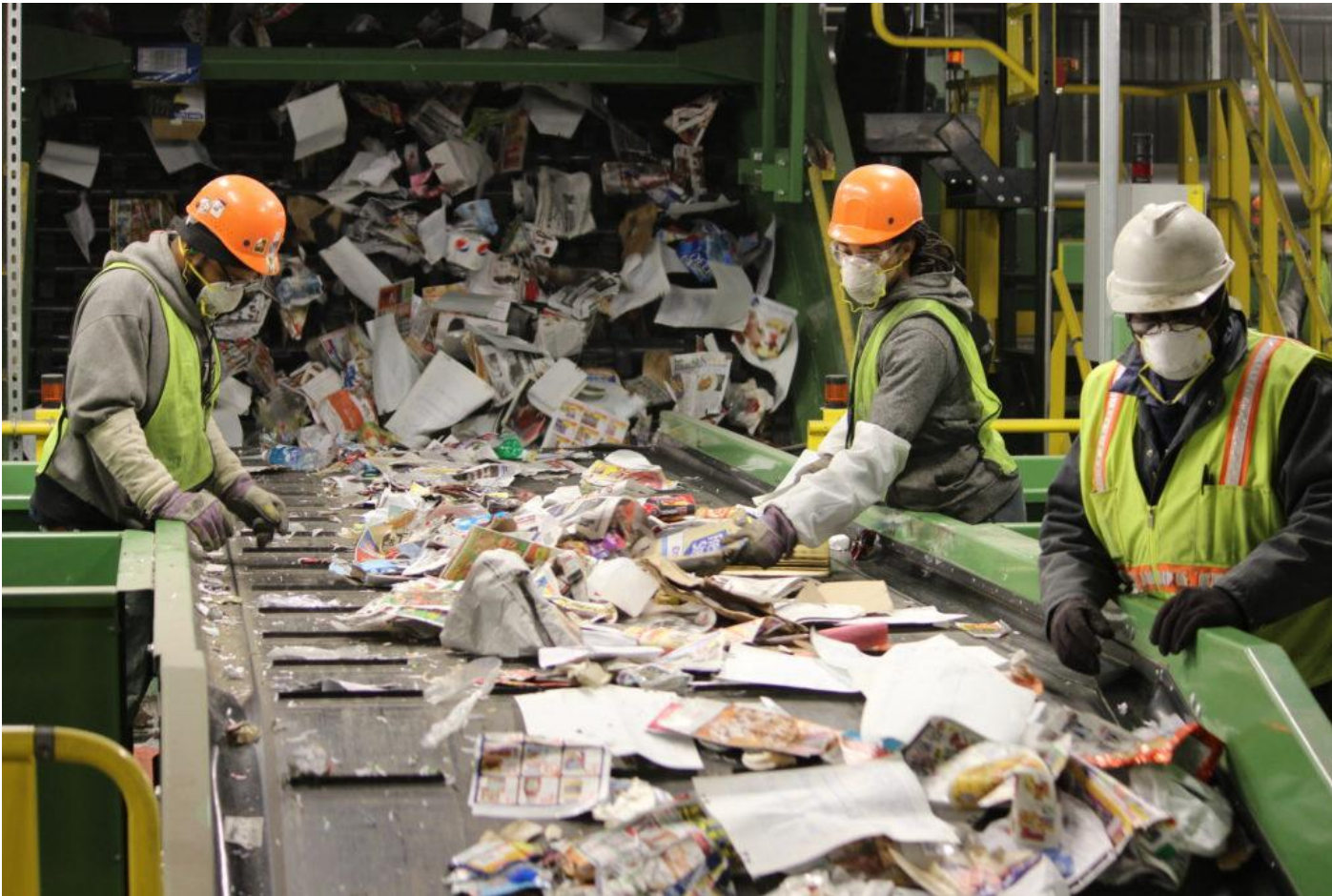
Workers sort the recycling

https://www.kci.com/resources-insights/innovator/new-recycling-facility-turns-green-gold/