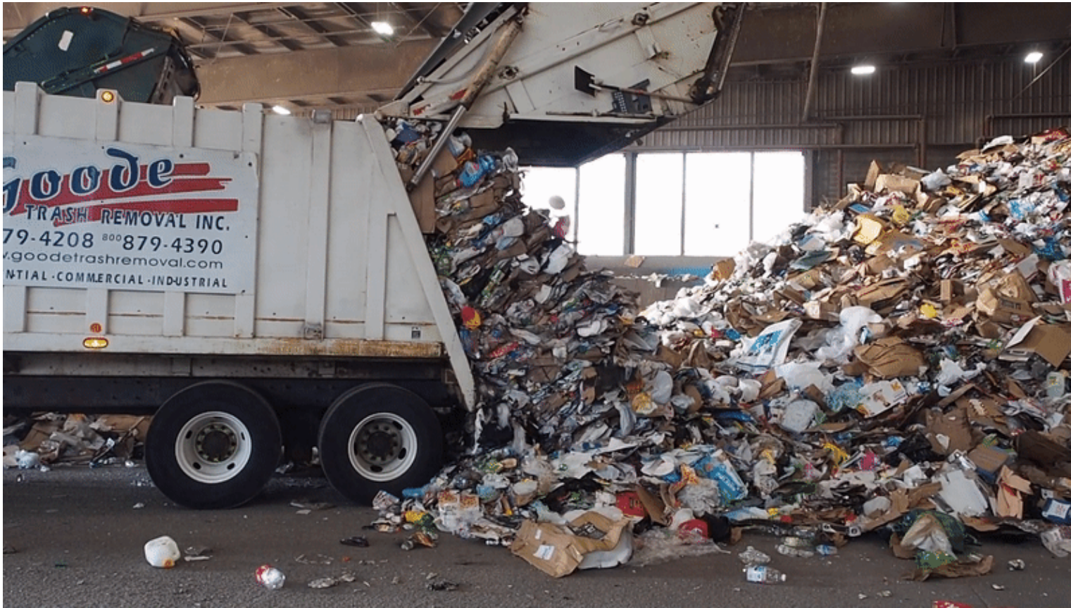
The truck dumps all of the recycling at the recycling plant

https://wamu.org/story/19/02/12/does-your-recycling-actually-get-recycled-yes-maybe-it-depends/