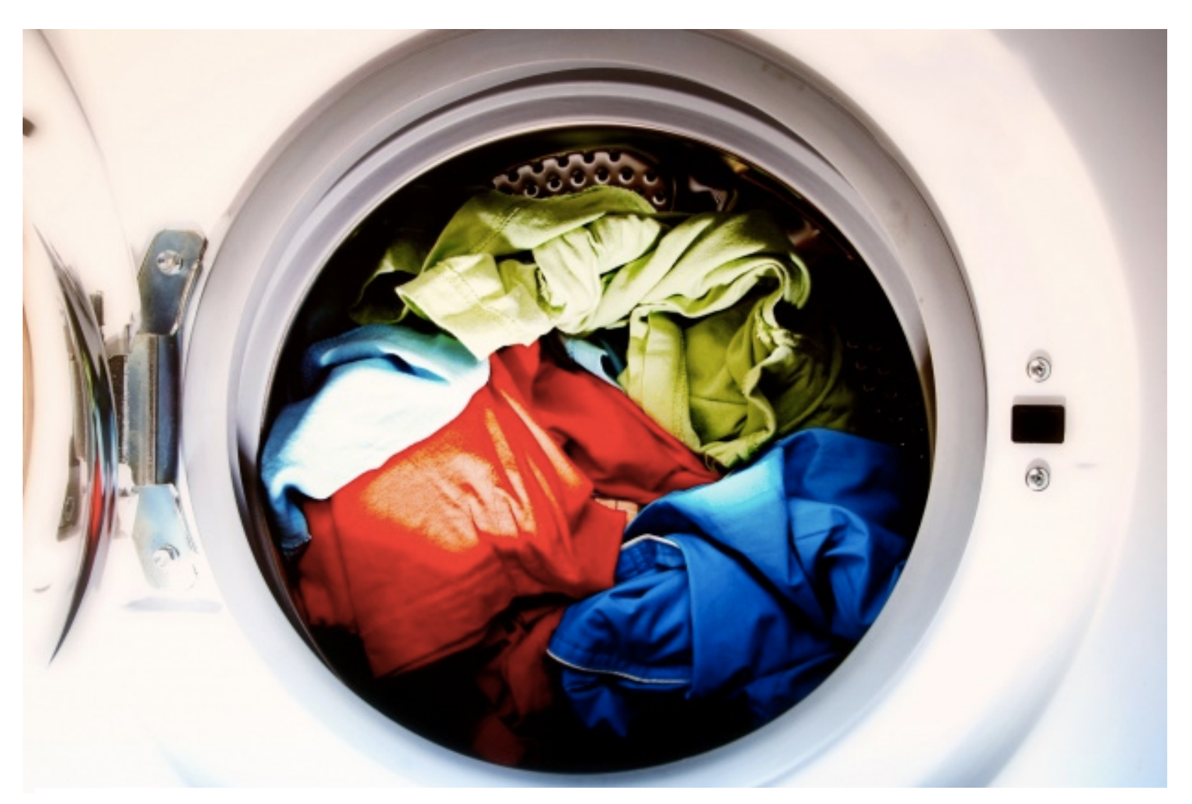
After being washed your laundry needs to be dried. You dry your laundry by placing it in a dryer or drying machine.