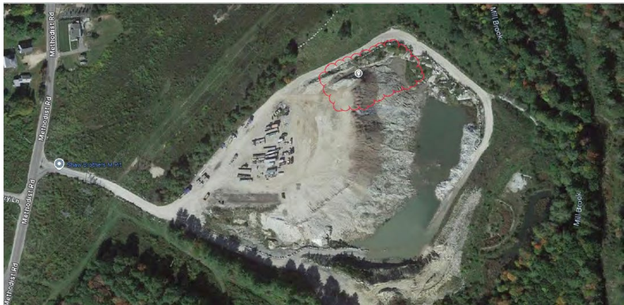
Proposed Disposal Area at Shaw Brothers in Westbrook, Maine