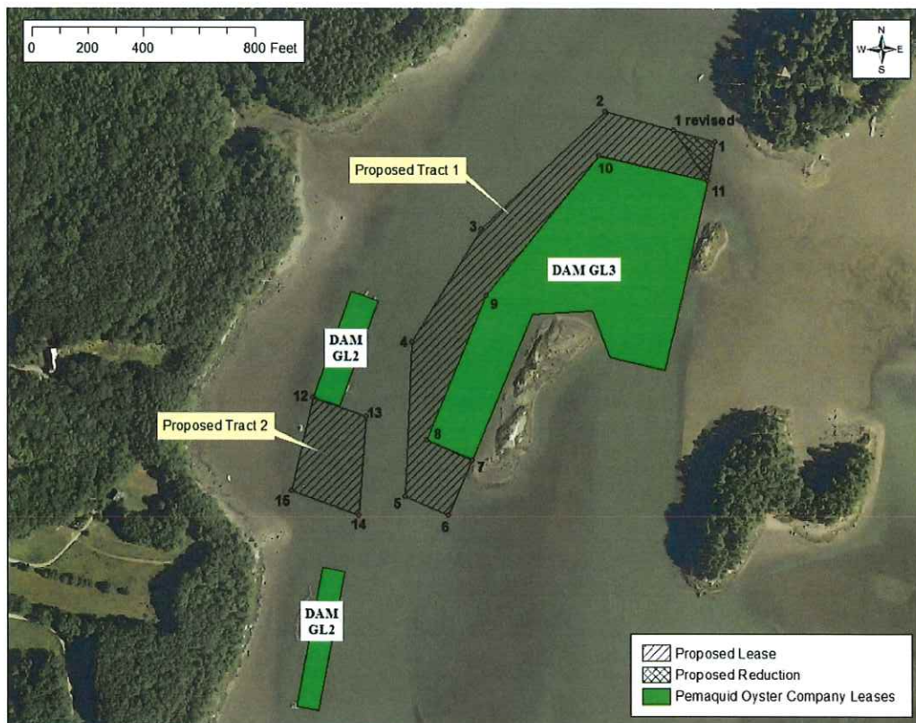
Figure 1: Proposed reduction to corner 1 of Tract 1.