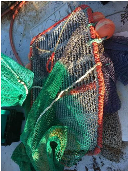
Compound grate on the November Gale.

The Nordmore grate is designed to exclude finfish by allowing small animals, like shrimp, to pass between the grate’s bars to be caught in the codend, while larger fish escape. The compound grate has two sections: one with Nordmore-like bar spacing to exclude finfish, and the other with smaller bar spacing, sometimes tapered, to allow the escape of small shrimp and fish.