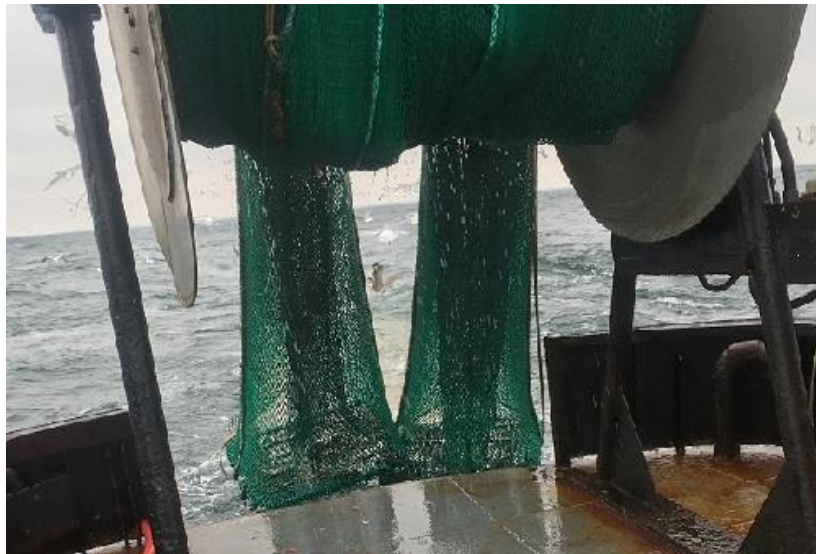
Trouser trawl on the North Star.