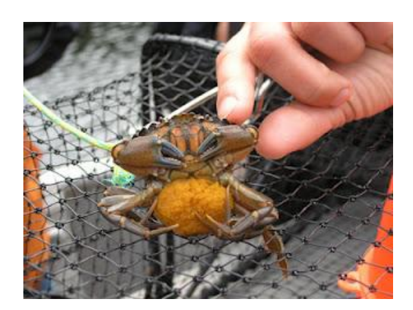
Berried Female Crab