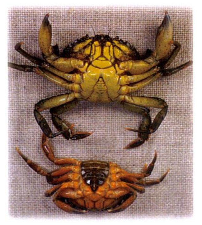
Male (top), female (bottom)

The shape of the abdomen or tail flat is a thin triangular apron for males, while the female's is larger and rounder.