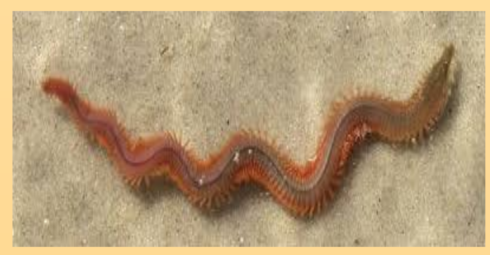
Sandworm (Nereis virens)

Head Palp Antenna Prostomium Peristomial Cirrus Perstomium Segment (asetigerous) Setiger Parapodium Seta Parapodium Anus Anal Cirrus Seta Poppidium Anus Anal Cirrus Parapodium Neuropodium Parapodium Parapodium