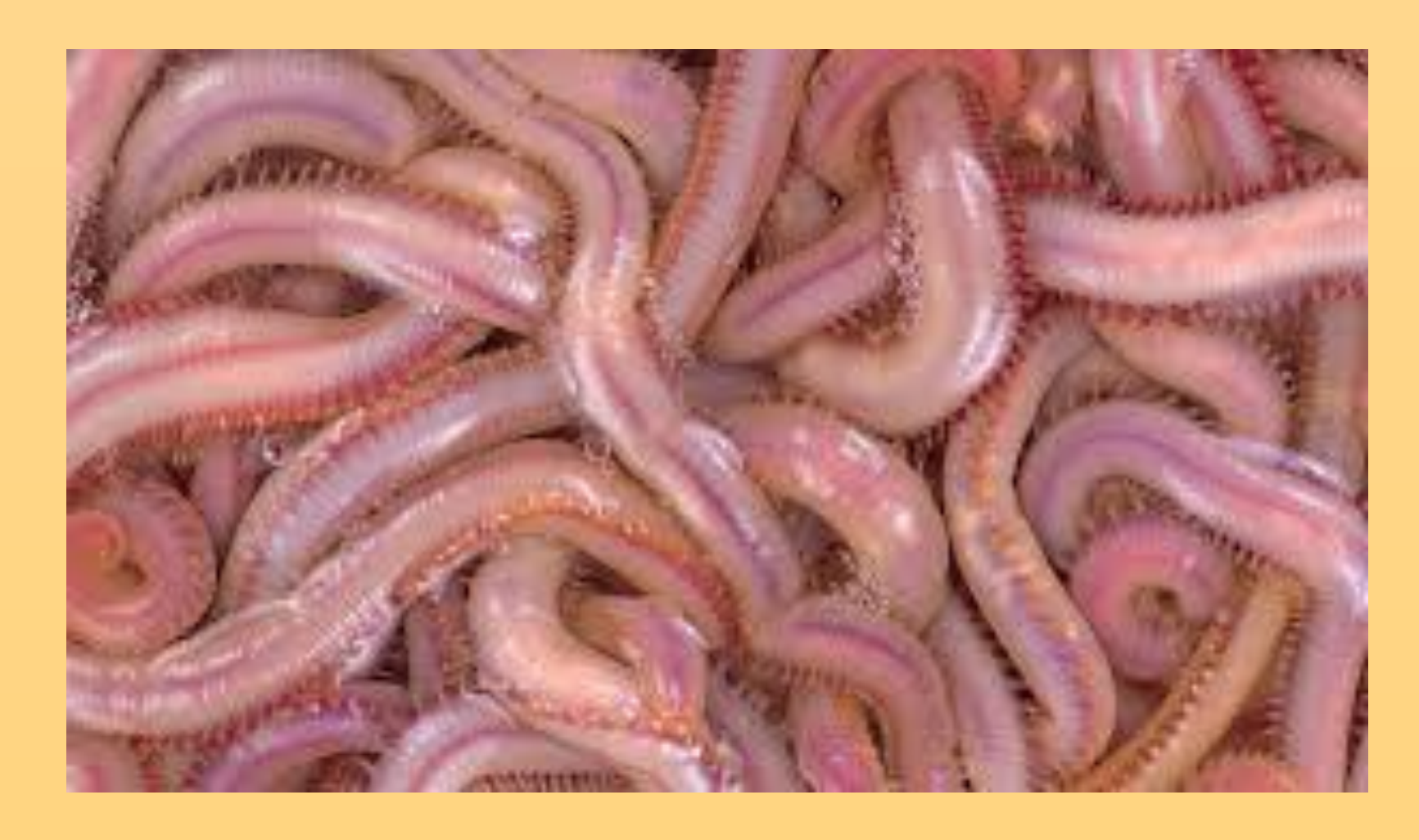
Bloodworm (Glycera dibranchiata)

Head Palp Antenna Prostomium Peristomial Cirrus Perstomium Segment (asetigerous) Setiger Parapodium Seta Parapodium Anus Anal Cirrus Seta Poppidium Anus Anal Cirrus Parapodium Neuropodium Parapodium Parapodium