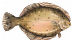
WINTER FLOUNDER ( Pleuronectes americanus )

Size: Minimum size 12 inches. Bag limit: 8 fish per angler per day.