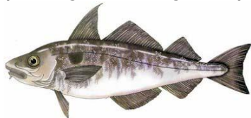
HADDOCK ( Melanogrammus aeglefinus )

Size: Minimum size 17 inches. Bag limit: 15 fish per angler per day. Season: Cannot possess haddock from March 1 through March 31 inclusive.