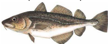
ATLANTIC COD ( Gadus morhua )

Size: Minimum size 21 inches. Bag limit: 1 fish per angler per day. Recreational Season: April 1 -14 and Sept 15-30, inclusively. Charter Season: April 1 -14 and Sept 8-Oct 7, inclusively.