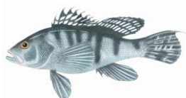
BLACK SEA BASS ( Centropristes striatus )

Size: Minimum size 13 inches. Bag limit: 10 fish per angler per day. Season: May 19 – September 21 and October 18 – December 31, inclusive.