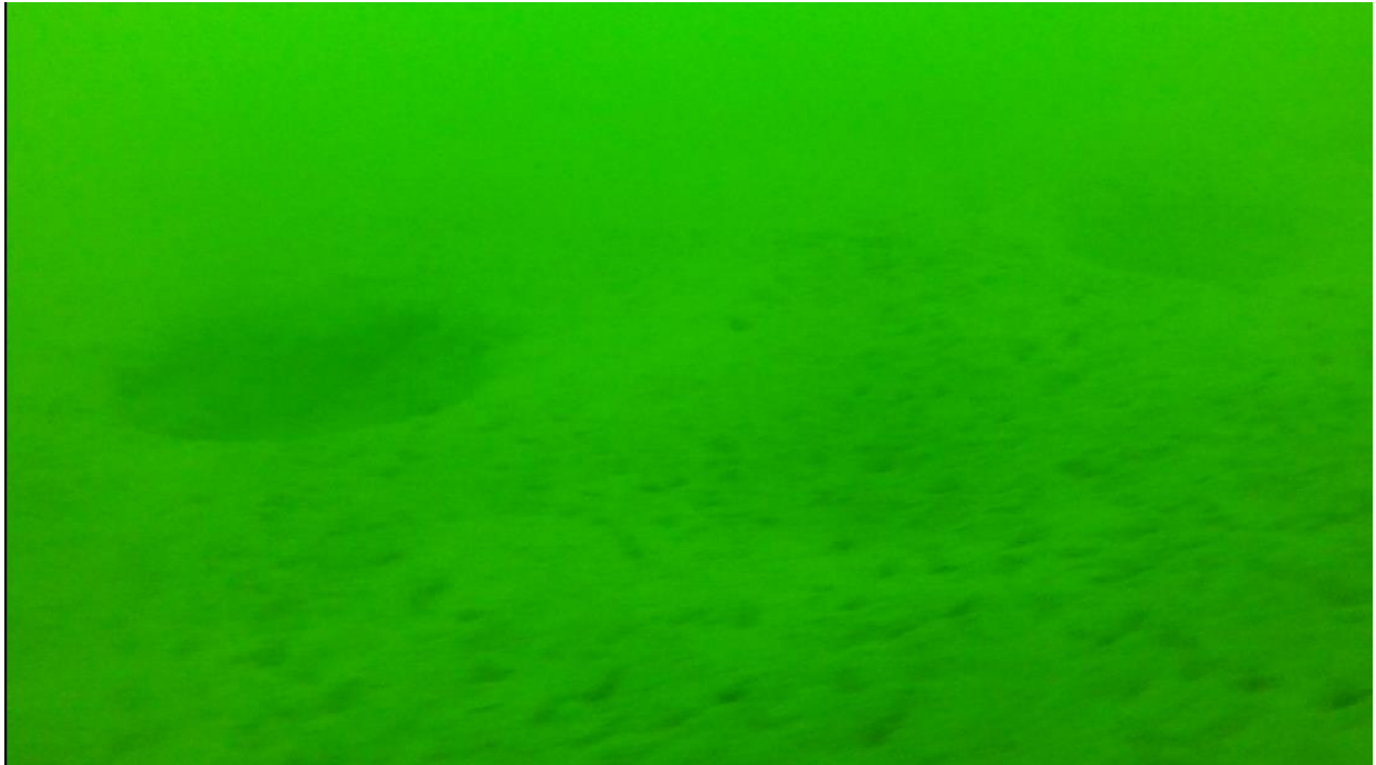
Image 1: Mud on the bottom of the proposed lease area (September 1, 2021).