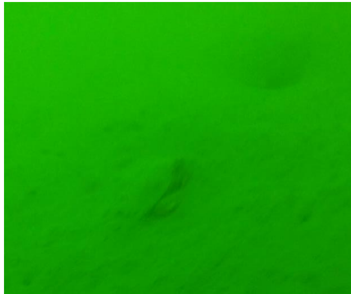
Image 2: A crab ( Cancer sp. ) observed on the bottom of the proposed lease area (September 1, 2021).